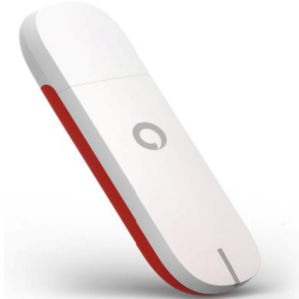
Figure 1-1 K3772 profile

Figure 1-1 shows the profile of the K3772.