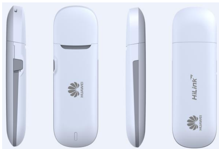
Figure 1-1 HiLink E3131 profile

Figure 1-1 shows the profile of the HiLink E3131.