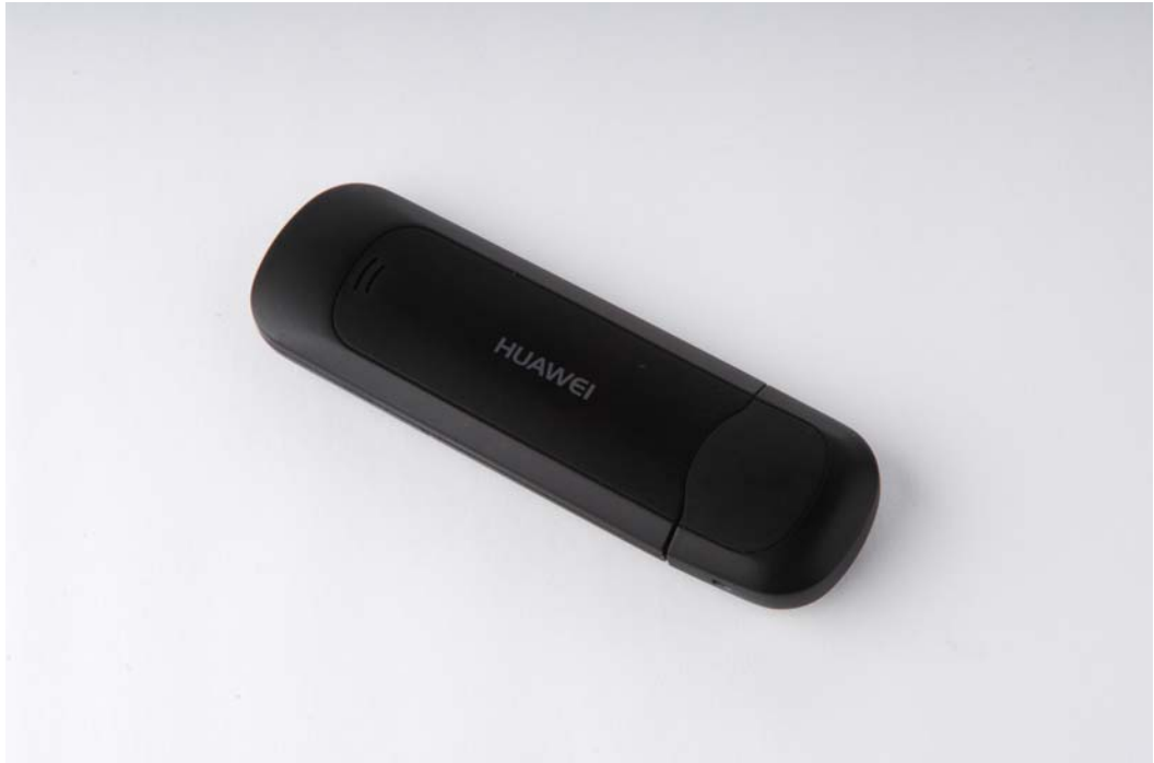
Figure 1-1 E1550 profile

Figure 1-1 shows the profile of the E1550.