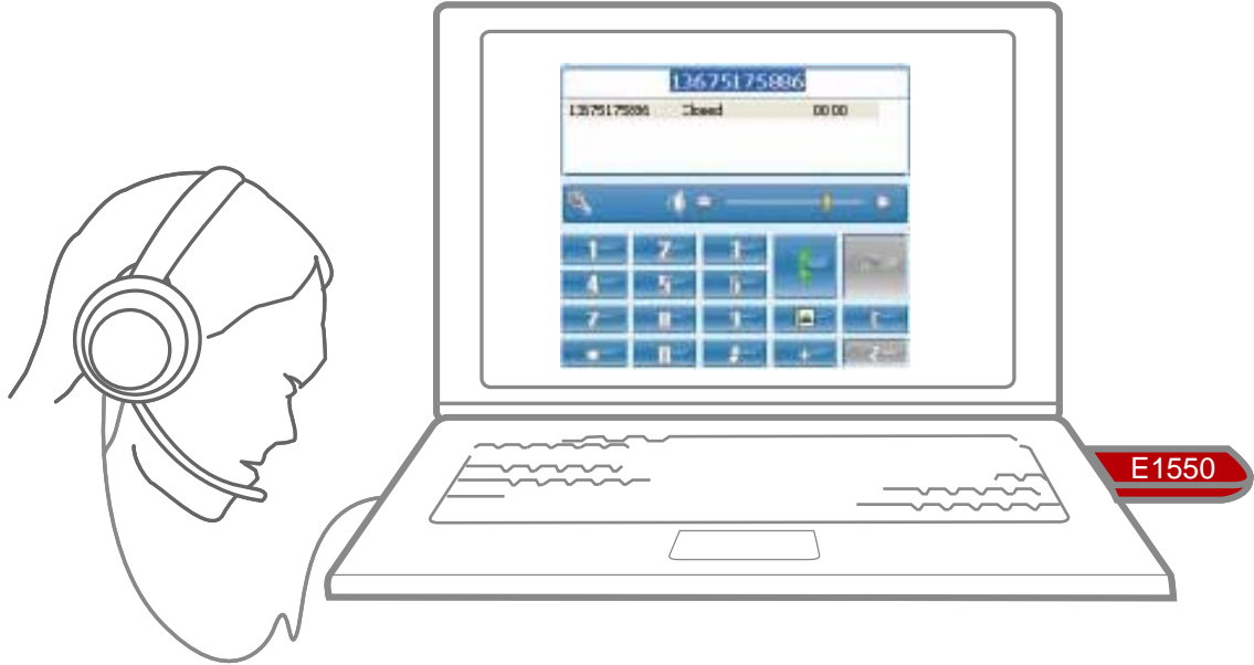
Figure 3-1 Voice service interface

Figure 3-1 shows the voice service interface.