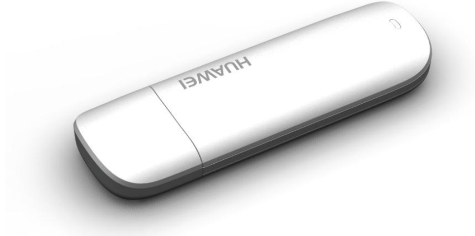
Figure 1-1 E173 profile

Figure 1-1 shows the profile of the E173.